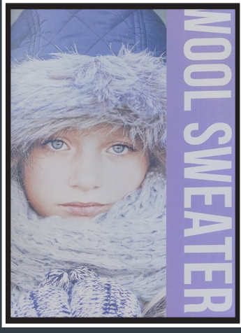
F Ink Kaleido™ 3 Outdoo

This color platform has fast updates and a wide temperature range, ideal for outdoor installations.