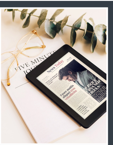
RAND Nors Series